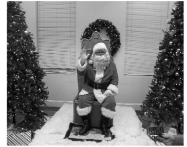
Christmas in Davidson December 4 - 6, 6:00 - 9:00