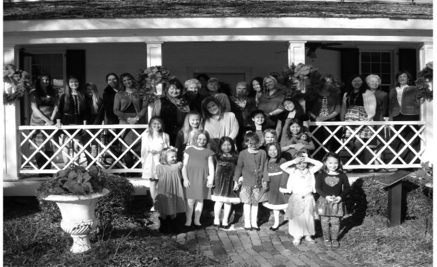
4 th Annual Mother/Daughter Tea at the Historic Beaver Dam House December 14, 1:30 – 3:00 p.m. See page 4.

To register call us at 704-892-3349 or visit us online at: www.townofdavidson.org/dpr .