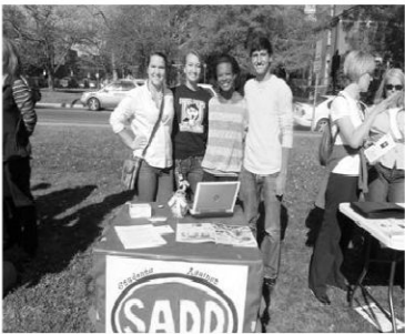
Gathering on the Green October 11, 12:00 - 1:30 p.m.

Day: Wednesday Date: September 10 Time: 1:00 - 2:30 p.m. Location: Davidson Town Hall Board Room