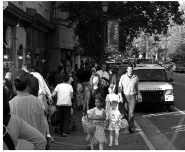
Halloween March October 24 – 5:00 p.m.