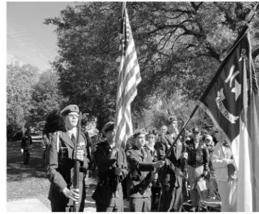
Veterans Day November 11, 11:00 a.m.